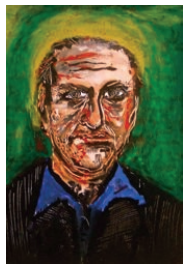
Museum of Reconstituted Charity Shop Art: The Jesus of Finsbury Park (Acrylic on framed barbour print)