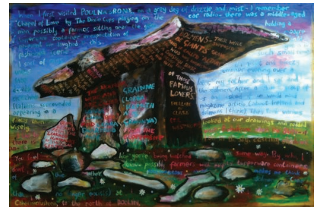
West of Ireland Landscape Painting Machine, no.1: Poul nabrone Dolmen (Acrylic and ink on canvas)