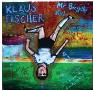
Klaus Fischer: Mr Bicycle Kick (Acrylic on canvas)